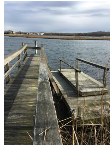
Float stored for winter.