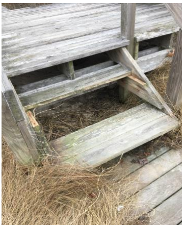
Minor damage to steps