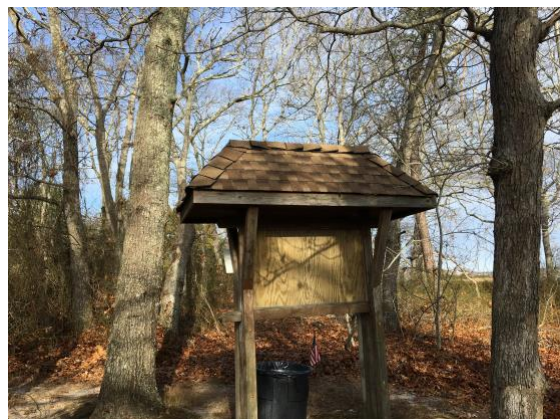
New Roof Shingles for Bulletin Board