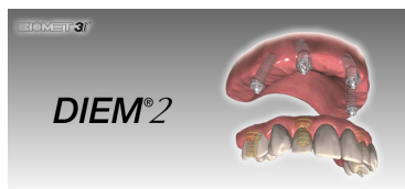
Click on image for more information