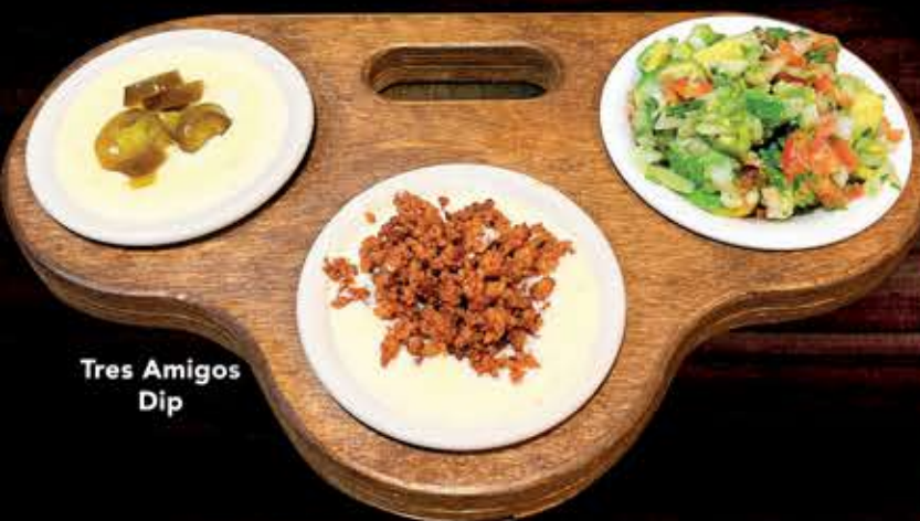
Tres Amigos Dip

Grilled sub-style bread with chopped grilled steak, salchicha (hot dog franks), melted shredded cheese, grilled onions, jalapeños, avocado slices, and topped with a fried egg. 11.75 (Add fries 3.00)