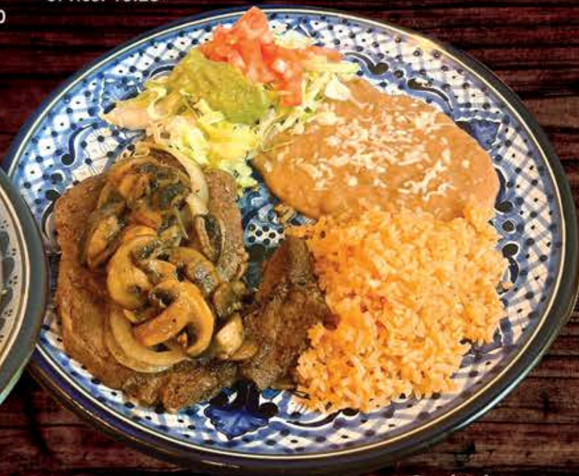
Steak a la Tampiqueña