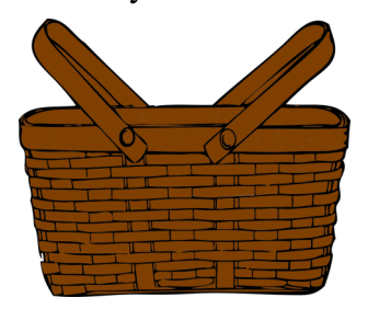
Church Picnic April 27th