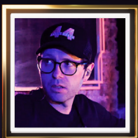
CONRAD BAUER GUITAR