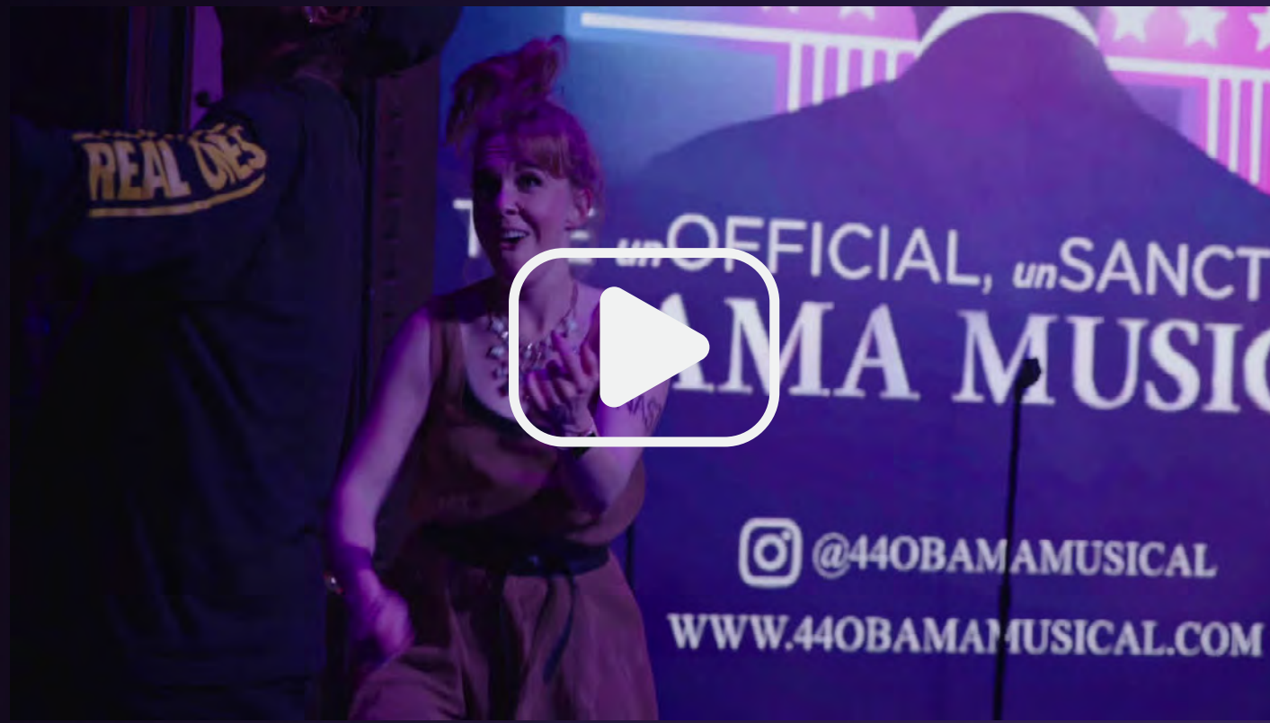
Sizzle Reel #1