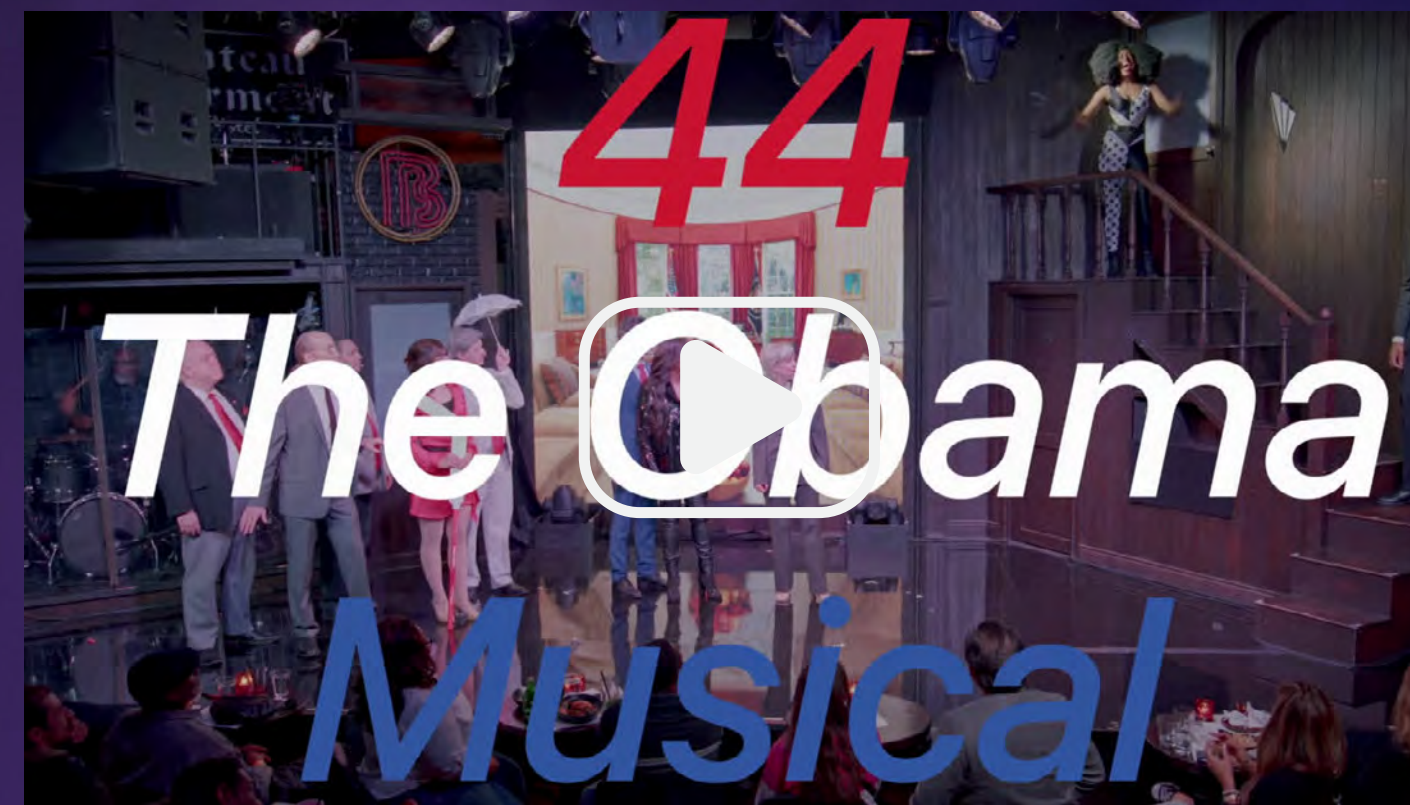
Sizzle Reel #2