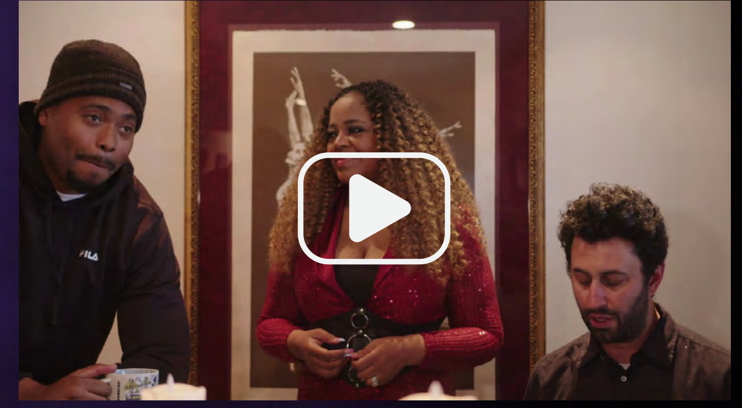
White House Love