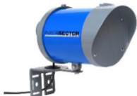
MS Sedco Intersector SDLC Part Number: TC-OA-SDLC