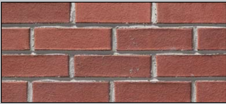
CR Red Smooth