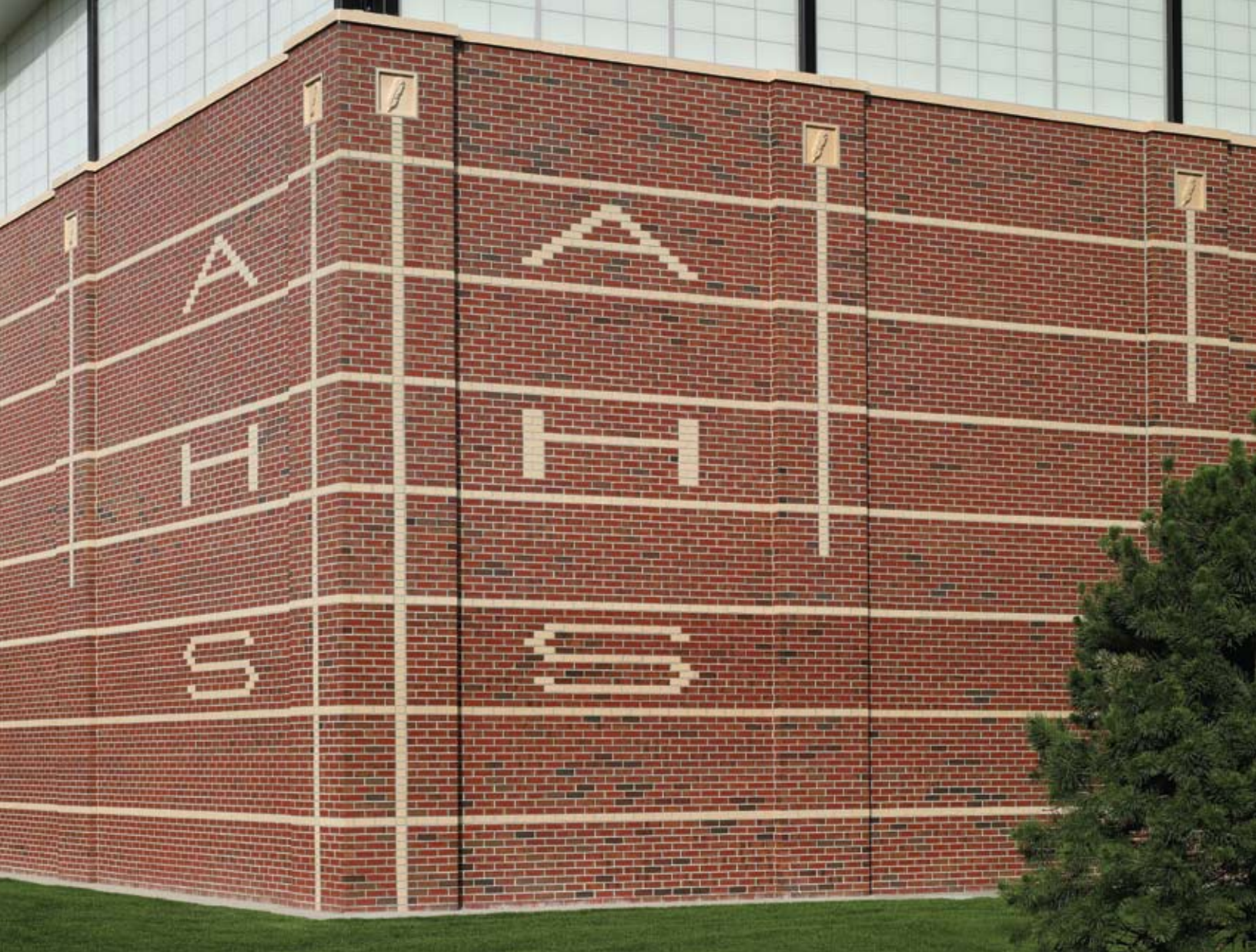
Front and back covers: Arapahoe High School, Centennial, Colorado. Harvard smooth modular brick with Desert Tan velour modular brick accent.

Although “sustainability” is a fairly new term, the basic concept has been part of Acme Brick Company since its founding. Since 1891, we have built and operated our brick plants close to population centers. Today our network is 24 plants strong—and our Castle Rock plant meets LEED’s “local production” criterion of 500 miles’ distance for all of Colorado and many of the surrounding states.