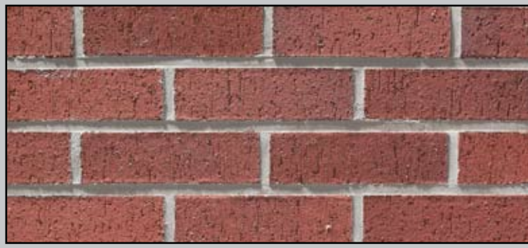
CR Red Velour