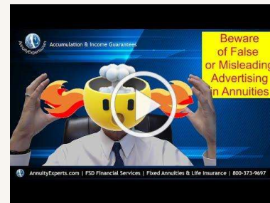
Beware of advertisements