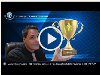
Top pick MYGA