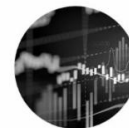
(FIA) Fixed Indexed Annuities