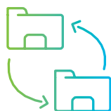
Financial flexibility and control of your money