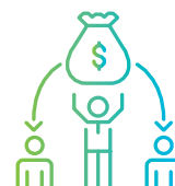
A legacy for your loved ones or favorite charity