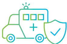
Protection from unexpected health-related costs