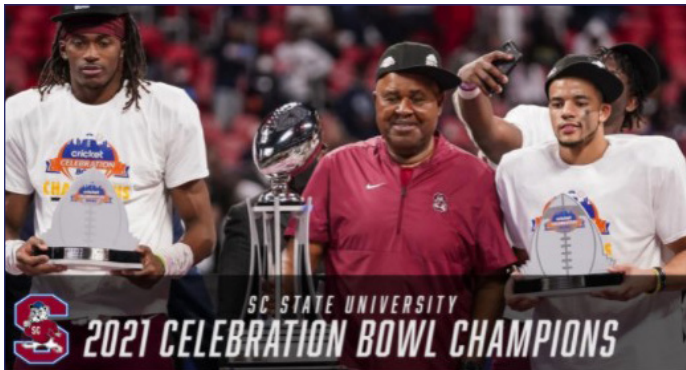
SC State won the 2021 Cricket Celebration Bowl Against Jackson State University 31-10.