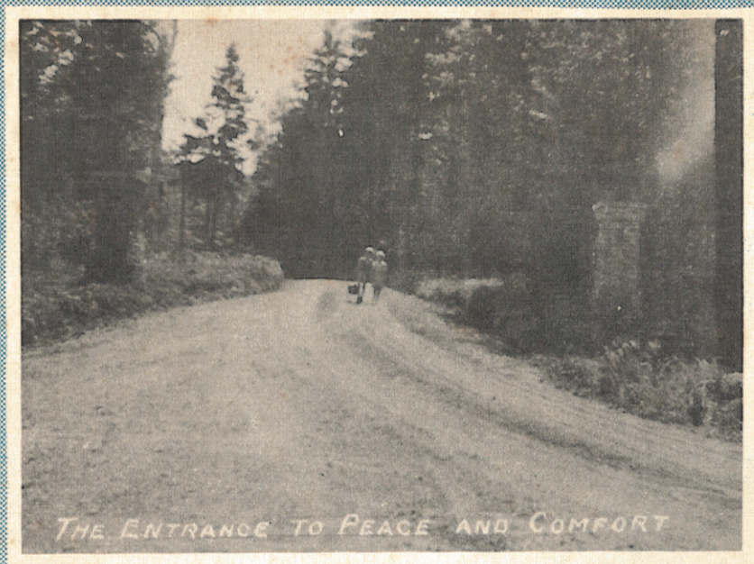
THE ENTRANCE TO PEACE AND COMFORT