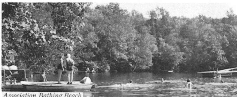
Association Bathing Beach

The lake is small ( 1\frac{1}{2} miles around it), is fed entirely by springs with underground outlets except overflow for high water season.