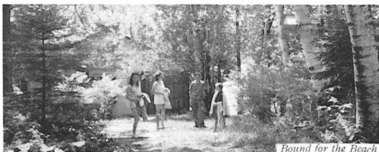
Bound for the Beach