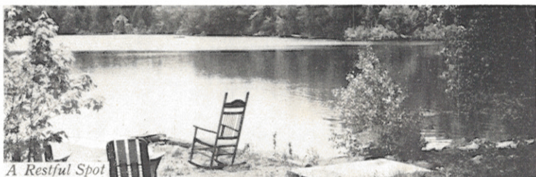
A Restful Spot

The store is open and mail service is provided from June 1st to October 1st of each year, with courteous persons in attendance every day and until ten o'clock p.m. A line of staple groceries, ice cream, candy and soda is always available.