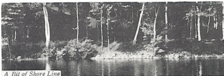
A Bit of Shore Line

An Association tennis court is maintained for those who wish to play.