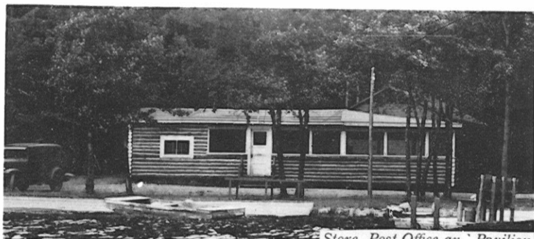
Store, Post Office and Pavilion

It is twenty-seven miles from Albany City Hall, on excellent hard road via Menands bridge; twenty miles from the business center of Troy and thirty-two miles from Schenectady. It is therefore within easy daily driving distance from Albany, Troy, Schenectady, Cohoes, Rensselaer or Watervliet.