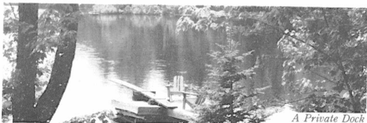
A Private Dock

Members may sell and transfer properties by deed to those approved by the Board of Governors as new members, on payment by such new members of the membership fee of one hundred dollars ($100.00). Purchasers must apply for membership and be approved before being entitled to own property.