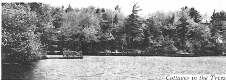
Cottages in the Trees

Elevation above sea level is 1800 feet and the summer temperature is never above 80 degrees and nights are cool for sleeping, with blankets necessary at all times.