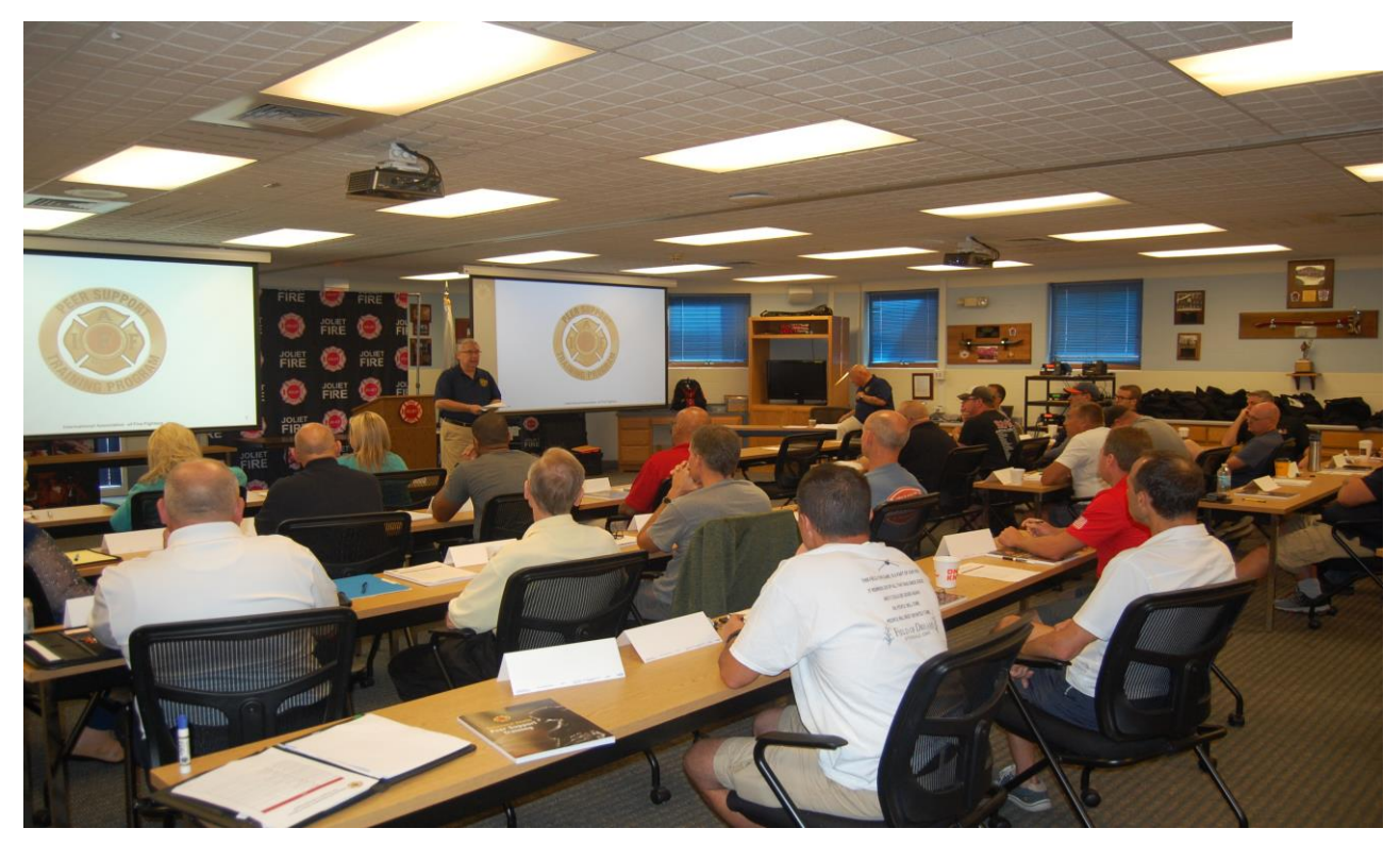
Peer supporters during the certification class at Station 1