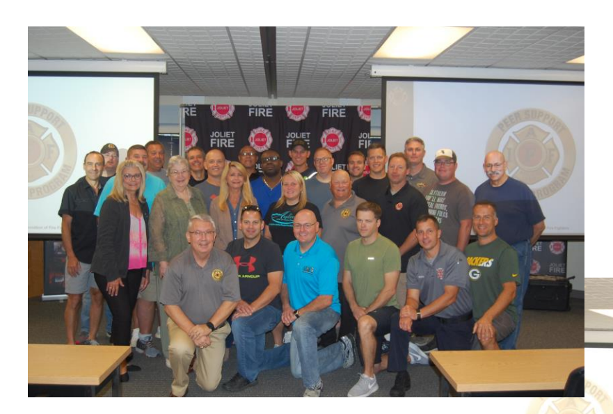
Joliet Firefighter Peer Support Group