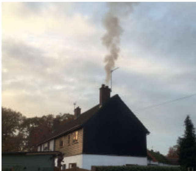
Smoke = wasted fuel, soot and tar in the chimney and unnecessary pollution.

There are four things that affect how hot wood burns in your stove: The efficiency of the stove and the chimney, the moisture in the wood (20% or less) and, most important of all, how you control or operate your stove. Put another way, you can have dry wood burning in an efficient stove, but if the air is closed off too much, then lots of unnecessary pollution is produced and you probably won't even know.