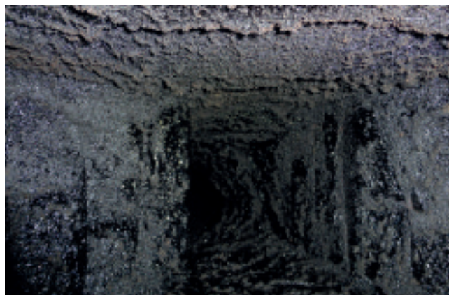
The wood in the stove was 'slumbered' for long periods, leading to a lots of pollution and a dangerous chimney.

You probably won't know, that's why it is so important to follow the BurnRight information in this brochure and talk to your sweep about it. Consumers are largely unaware of the issues. The government has highlighted BurnRight and the role of chimney sweeps in its 'Clean Air Strategy' . Follow the campaign at www.burnright.co.uk