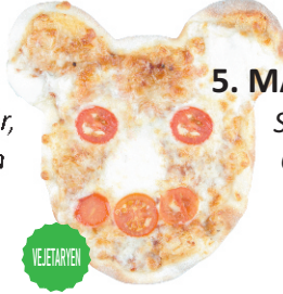
5. MALTA (Margherita) Suda Mozzarella, Cherry Domates 340 ₺