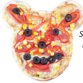
4. GERMANY Salam, Kapyra Biber, Mısır, Siyah Zeytin 395 ₺