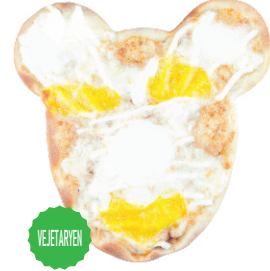
3. FRANCE Cheddar, Suda Mozzarella, Küp Peynir 395 ₺