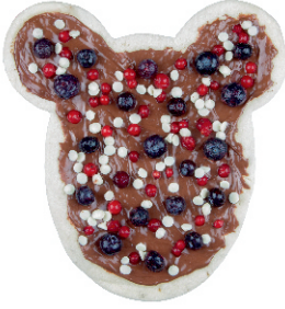
7. DENMARK Nutella, Yaban Mersini, Frenk Üzümlü, Beyaz Çikolata 290 ₺