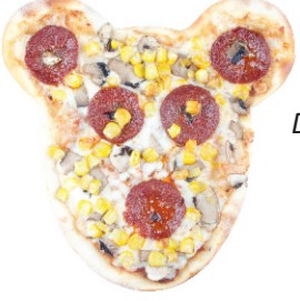
1. AMERICA Dana Kasap Sucuk, Mantar, Mısır 465 ₺