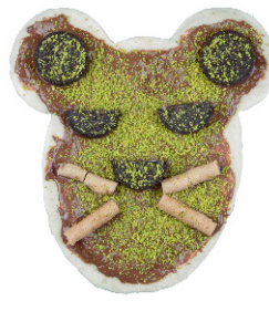
8. LUXEMBOURG Nutella, Antep Fıstığı, Rulokat, Oreo 290 ₺