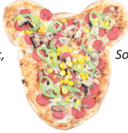
2. ENGLAND Sosis, Mantar, Mısır, Yeşil Biber 395 ₺