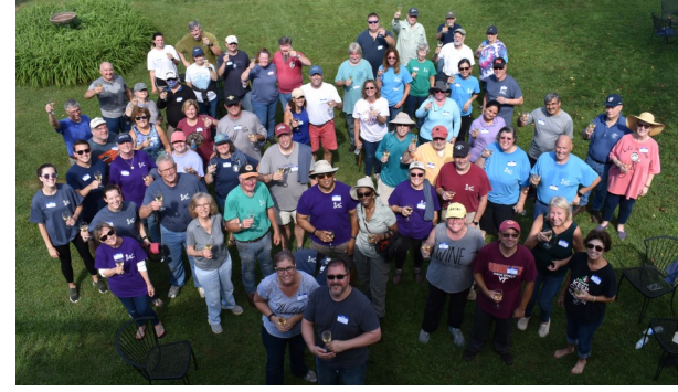
The 2021 Chardonnay harvest crew!

All varieties delivered small berries thus intensifying the color for reds as well as flavors for both whites and reds! The barrel tasting highlighted the intensity of the reds. The new releases of the Riesling and Victorian White are giving us a hint of what this incredible 2021 growing season has to offer!