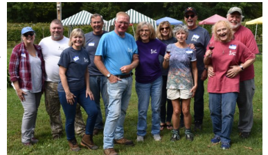
The 2021 Cabernet Franc and Petit Verdot harvest crew!

The 2021 harvest was both bountiful (a significant increase in volume over 2020) and of exceptional quality. We are thrilled with the early stages of fermentation and aging and look forward to sharing this new incredible vintage with you!