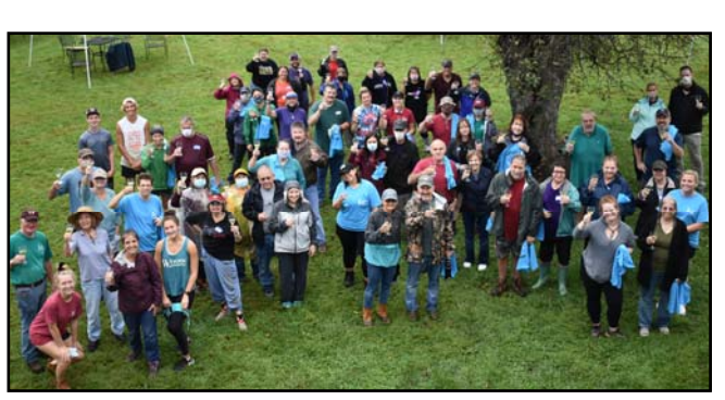
2020 Vidal Blanc harvesters