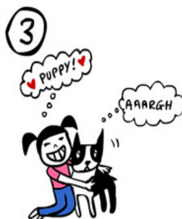
DON'T Grab or Hug him