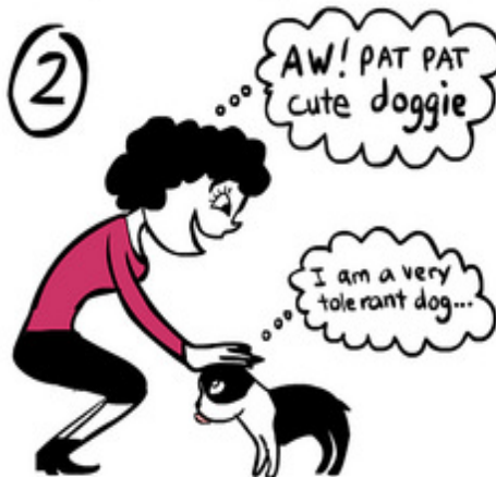
DON'T Lean over the dog & stick your hand on top of his head