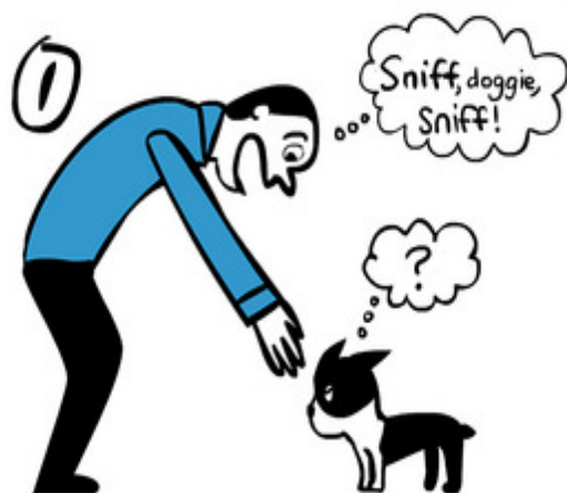
DON'T Lean over the dog & stick your hand in his face

Most people do this stuff and it stresses dogs out so they BITE! I don't care how cute you (or your kid) think Boogie is. Please show him some respect.