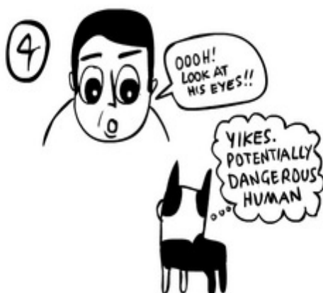
DON'T Stare him in the eye (This is an adversarial gesture)