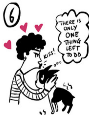
DON'T Grab his head and kiss it (This is an invasion of space)

Doing this to a dog who doesn't know you is like a perfect stranger giving you a great big hug and kiss in an elevator. Wouldn't that creep you out? And wouldn't you have the right to defend yourself?