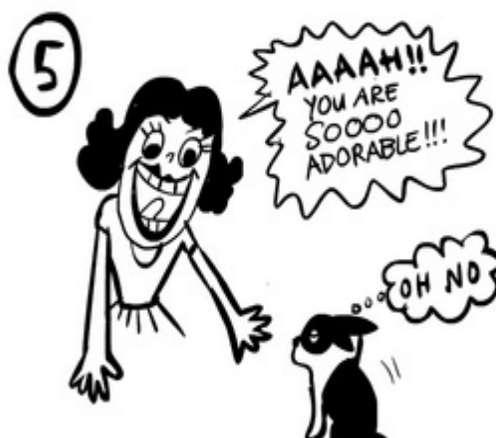
DON'T Squeal or shout in his face