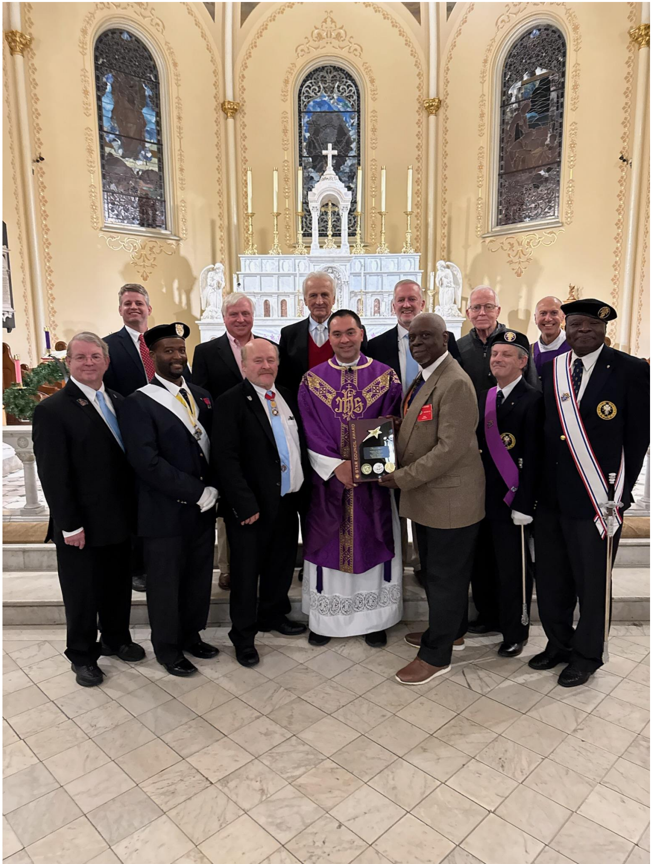
Honor Guard took part in the Presentation of the Star Council Award