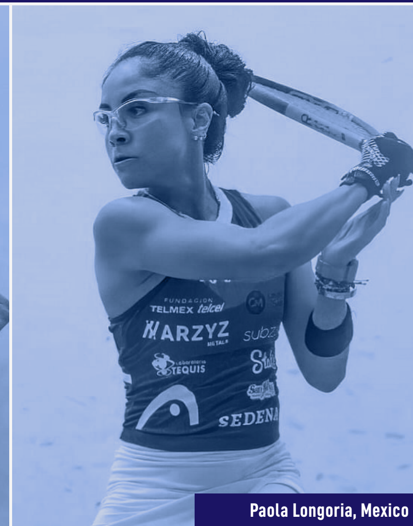
Paola Longoria, Mexico