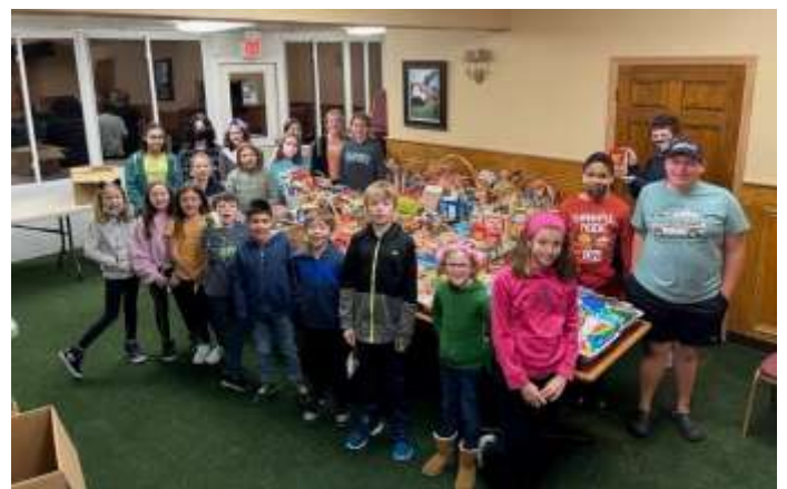
The AOH, Division 2, Babylon, NY Junior Boys and Junior Girls are to be commended for their charitable work. Supported by the division

Babylon Junior Division, St. Patricks Division #2, Suffolk County