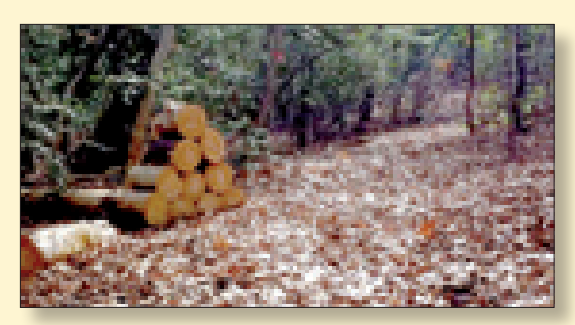
Trail maintenance is ongoing year-round.