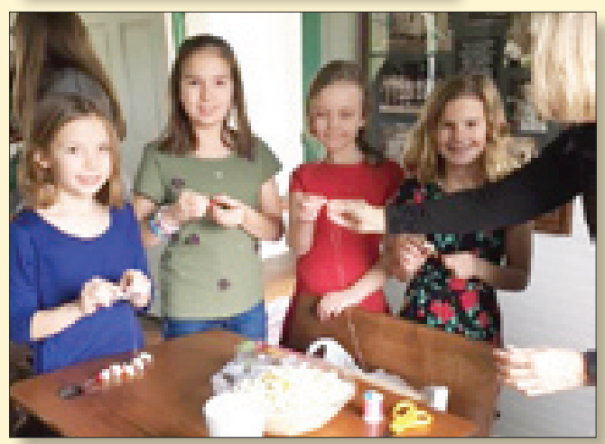
The Slate Page 6

cranberries to either hang on the Christmas tree in the schoolhouse or to take home and hang on their tree. They also enjoyed helping to decorate the tree in the schoolhouse with old-fashioned ornaments. It was indeed a magical time, and if you missed this fun glimpse back in time, be sure to mark your calendar for next year's gathering on the Sunday before Christmas.