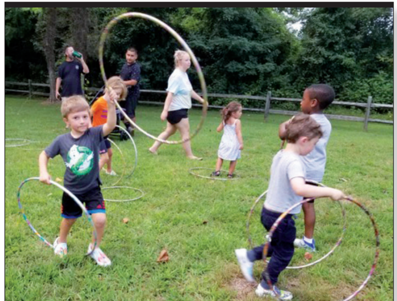
Kids experimenting with "hula hoops" at recent Ice Cream Social