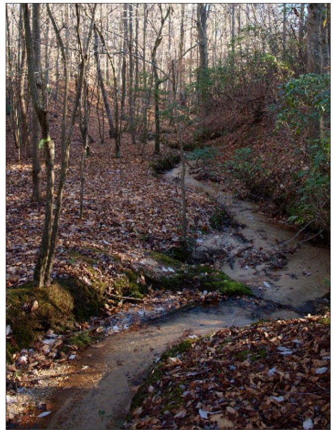
Scenes along the trail.