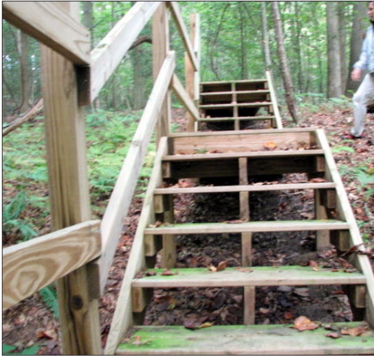
Steps on a hill along the trail.