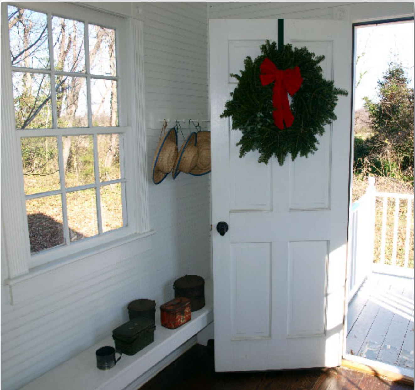
The entrance to the vestibule of our One-Room Schoolhouse is festively decorated for the holiday season.