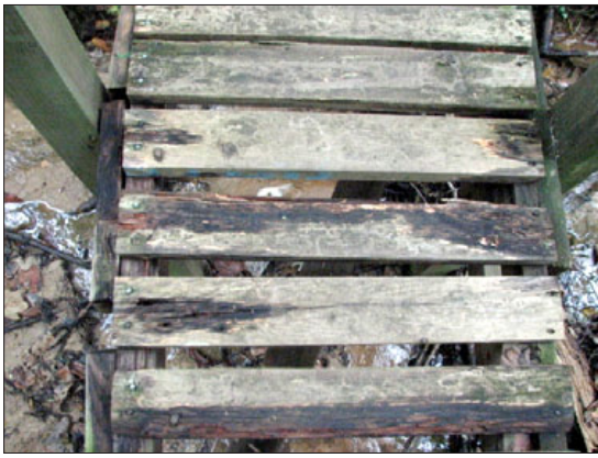
Bridge with rotted boards.