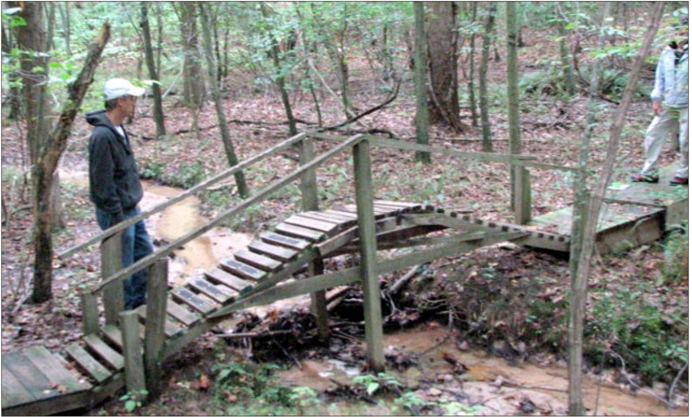
The trail's humpbacked bridge.

Running along the perimeter of the Christ Church property is a wonderful trail that includes important historic sites: a section of the never completed railroad bed that would have carried a rail line joining Drum Point to Baltimore and remnants of a rolling road used by farmers moving hogsheads of tobacco to the wharf at Port Republic. There are also woodlands, wetlands, a stream, and a meadow. Children spending the day at the One-Room Schoolhouse traverse this mile and a quarter trail. They leave filled with a sense of wonder and awe, feeling that they have truly gone back in time.