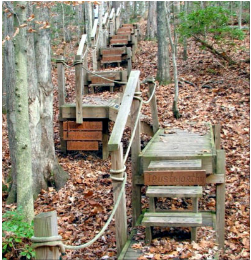
This set of steps remind walkers of the important character traits that all scouts strive to incorporate into their lives.