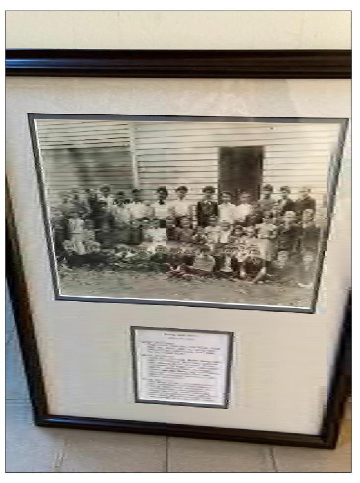
Children at the Broomes Island School in 1906