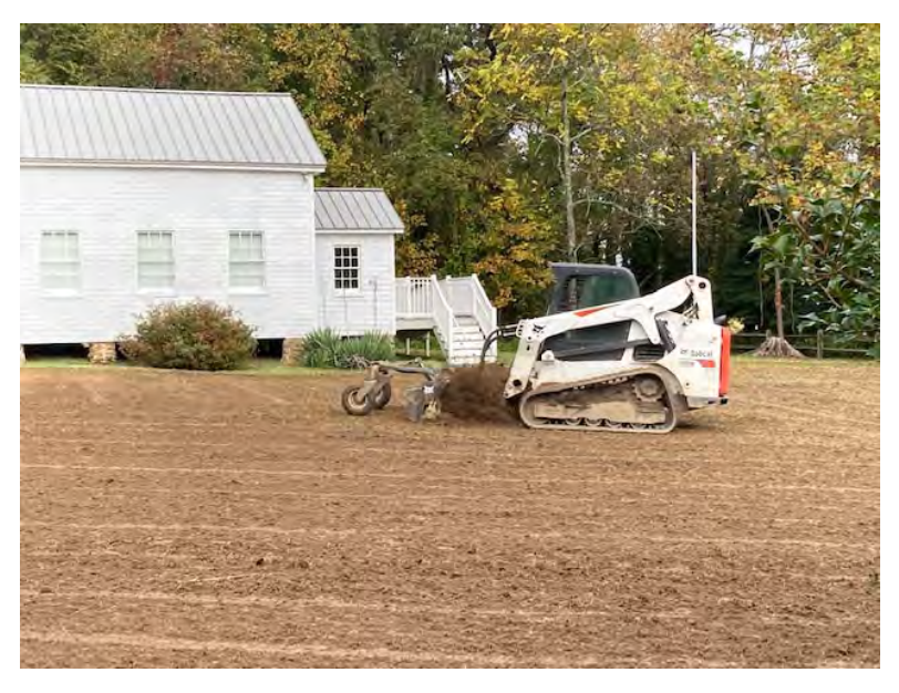
It was amazing to watch the ground being leveled and smoothed in short order.