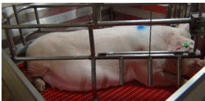
Figure 2: Sow in Farrowing Stall. Swine Medicine Education Center

Feed refusals that are observed in any growing animal are a key indication of poor health. Feed refusals that were observed in this study had more challenges during farrowing and an increase in stillborn piglets. Sows with locomotion issues showed a higher risk of mummified piglets, increased stillborn piglets, and a decrease in the number of piglets born alive. During this study, the sows body condition scores were recorded using a caliper. This study didn't show any connection between body condition and farrowing.