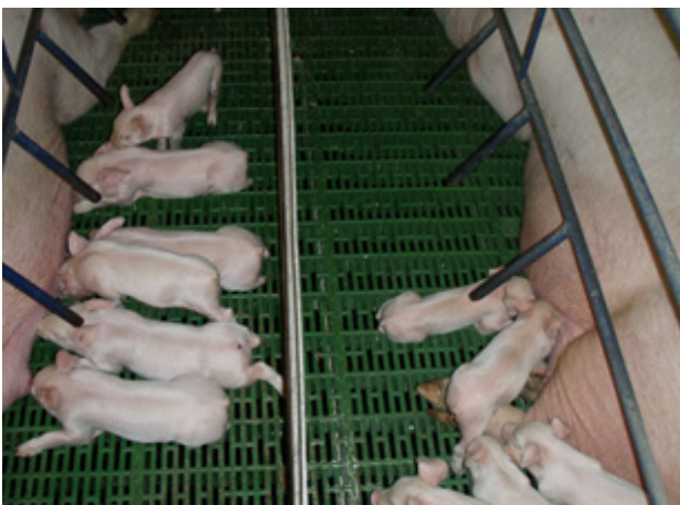
Figure 1: Nursing Piglets in Farrowing. Swine Medicine Education Center

Farrowing is the process of birthing a litter of pigs. Farrowing occurs approximately 115 days after a sow has been bred. Once the sow has given birth, it is the sow's job to raise the piglets with the help of the farm staff for approximately 3 weeks or around 21 days. Once the piglets are born, the sow has access to ad-libitum feed and water, meaning she can eat and drink as little or as much at any point in a day to ensure she can provide adequate milk for her piglets. These piglets will encounter routine procedures to ensure their health and welfare, such as vaccination and the daily occurrence of farm staff intervening with the sow.