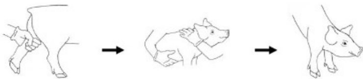
Illustration by Mary Breuer, Swine Medicine Education Center. Funding Provided by USDA APHIS through the National Animal Disease Preparedness and Response Program for the development of the Certified Swine Sample Collector training program.

When restraining a larger animal, a restraining snare is used as shown in Figure 3. It is important that the restrainer has had proper training with this tool for the safety of the animal and the caretaker. Remember not to restrain the pig for longer periods of time, move the pig with the snare, or tie the pig up with the snare.