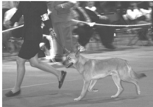
Thaddeus gating in the breed ring.

Also representing our breed in the ring were CH Mazel Tov Mystery Girl and Cando Bobbysox N Saddleshoes.