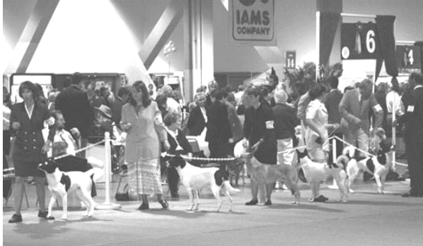
All the dogs wonderfully represented our breed.

Seven Canaan Dogs were entered in this year's Invitational.