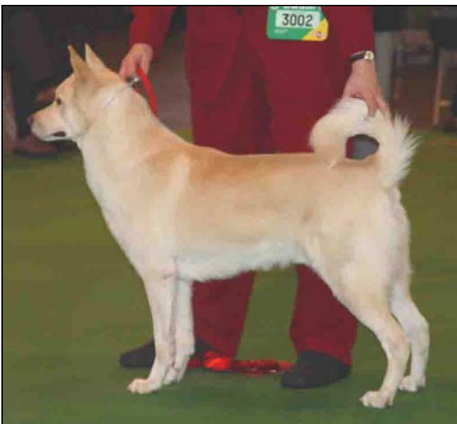
Best of Breed, Anacan Masterpiece

Best Dog and Best of Breed went to Anacan Masterpiece, Reserve Best Dog was awarded to Anacan Ziggy, Best Bitch and Best of Opposite Sex was garnered by Lorianna Lucky Star, Reserve Best Bitch was Anacan Simply Irresistible and Best Puppy was handed to Babrees Rumor Has It.