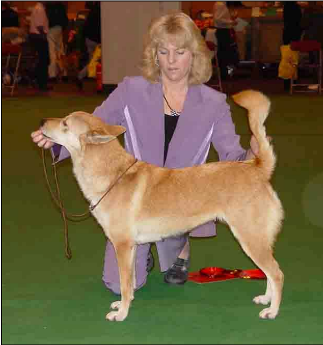
Best Bitch, Lorianna Lucky Star

Best Dog and Best of Breed went to Anacan Masterpiece, Reserve Best Dog was awarded to Anacan Ziggy, Best Bitch and Best of Opposite Sex was garnered by Lorianna Lucky Star, Reserve Best Bitch was Anacan Simply Irresistible and Best Puppy was handed to Babrees Rumor Has It.