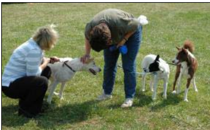
Maccabee trying to decide who is more attractive: black and white Smudge or liver Rivi???