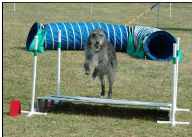
This is just to prove that there were breeds other than Canaan Dogs entered at the trial! This is a very happy Scottish Deerhound. You should have seen it get through the tunnel