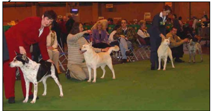
Best Male competition