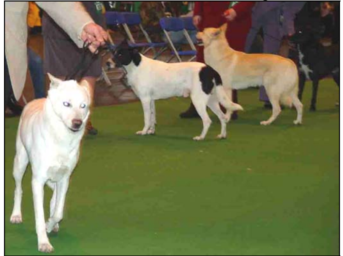
Open Dog Class