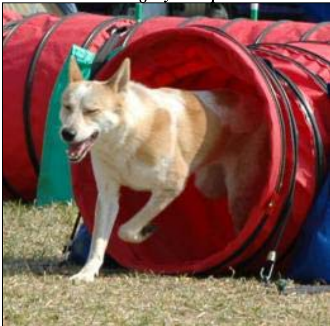
CDCA Agility Trial photo