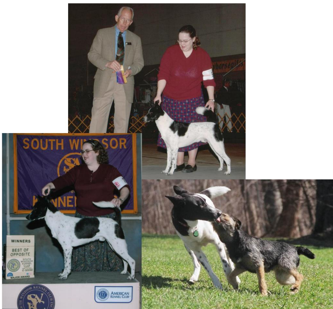
From left to right: "Harry", "Heidi" and "Peter"

CH Pleasant Hill Hinda M. Rosendog, C.D. – "Heidi" 2002 WKC BOS • 2001 CDCA HIT • 2000 CDCA WB • Multiple BOB Winner