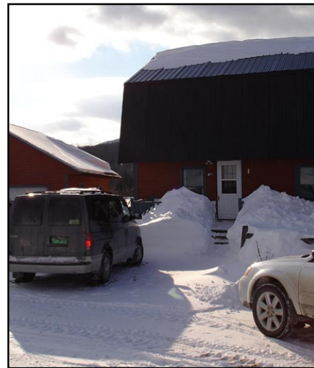
Our front door, winter 2007. We are braced for the rest of winter to return ... any moment now.