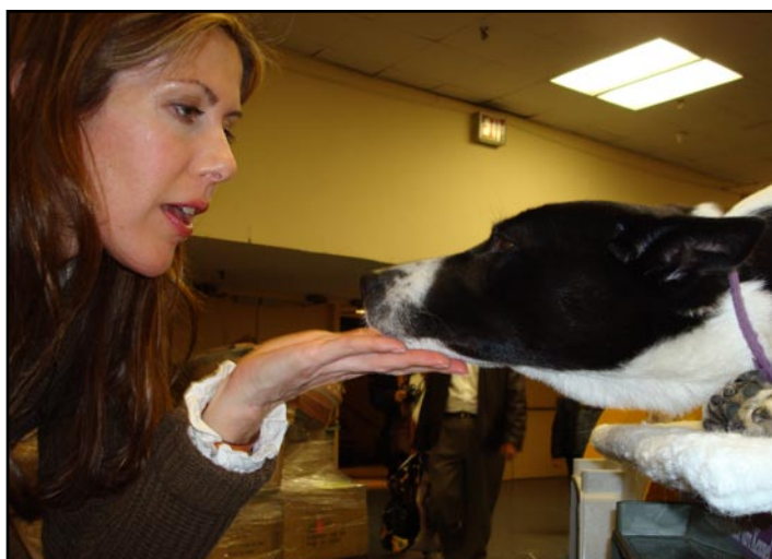
Look into my eyes...