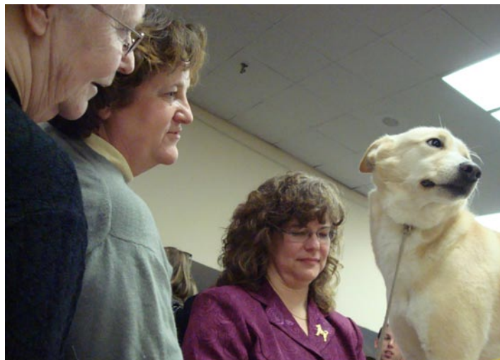
Jewel meeting some interested folks.