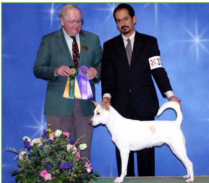
Winners Bitch - Midsummer Mackenzie

“As a postscript, it was so nice to see so many of your exhibitors sit down together at a fun dinner after the show. This does not happen in too many other breeds.”