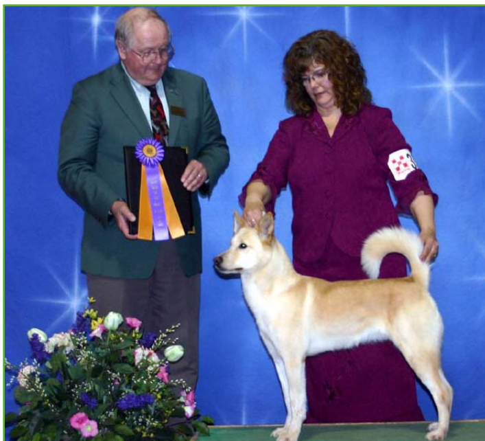
Best of Breed - CH Cherrysh Crown of Jewels