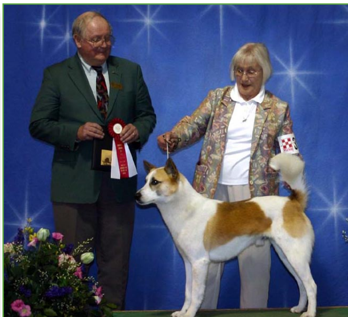
Best of Opposite Sex - CH Pleasant Hill Wish Granted