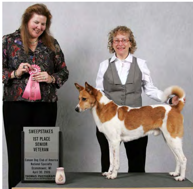
Veteran Sweepstakes 1st Place Ch. Pleasant Hill Maze