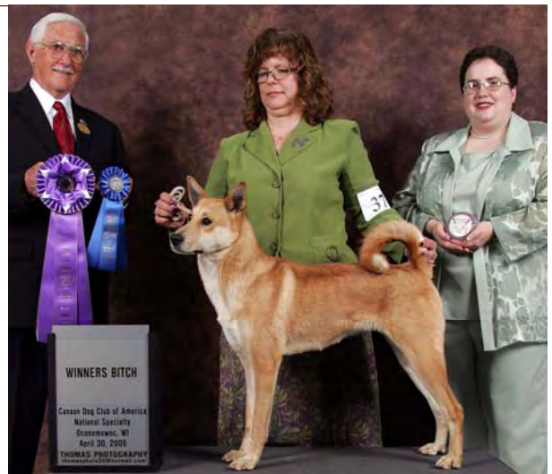
Winners Bitch Cherrysh Burning Desire