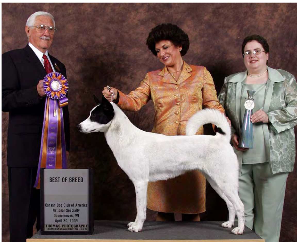
Best of Breed