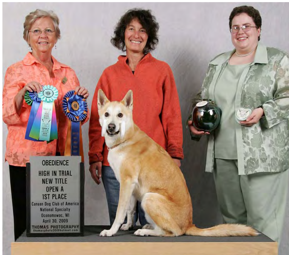
High in Trial HaTikva Cherysh Taavi Dream, CDX