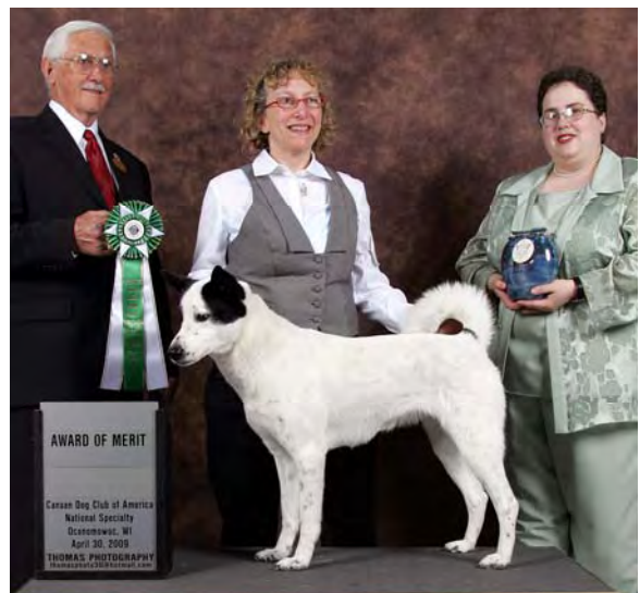
Award of Merit Ch. Mazel Tov Yomi bat Barak