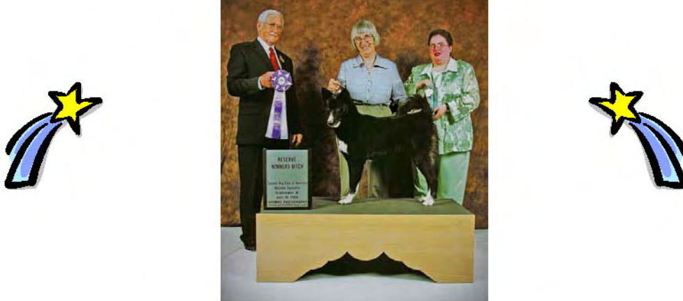
Blue Sky Desert Star Luna Eclipse, CDCA-HC ("Luna")

... ....His Sisters Also Had Fun That Day!