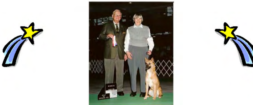
Blue Sky Desert Star Ball Of Fire ("Nova")

1st Place - Bred By Exhibitor, Bitches Reserve Winners Bitch