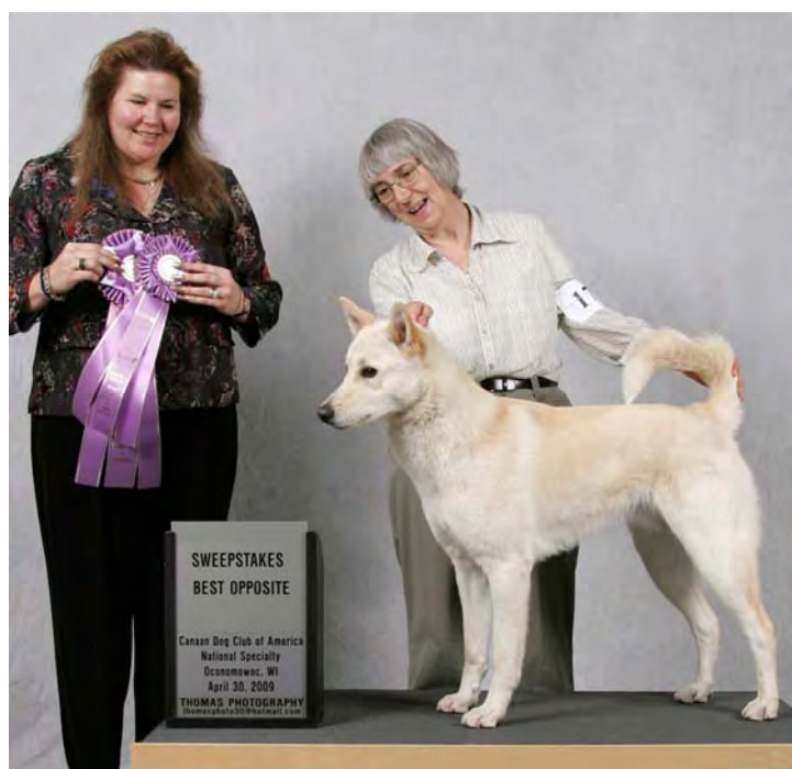
Best of Opposite Sex in Puppy Sweepstakes BlueSky DesertStar Orion the Hunter