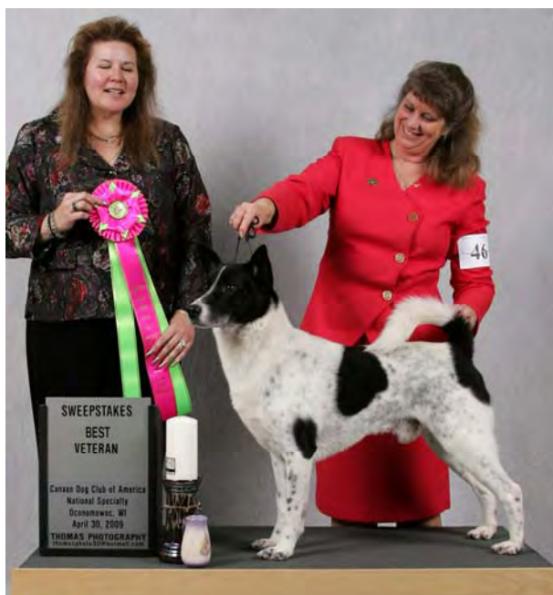
Best in Veteran Sweepstakes Ch Pleasant Hill What's the Buzz, OA, OAJ, OAP, OJP