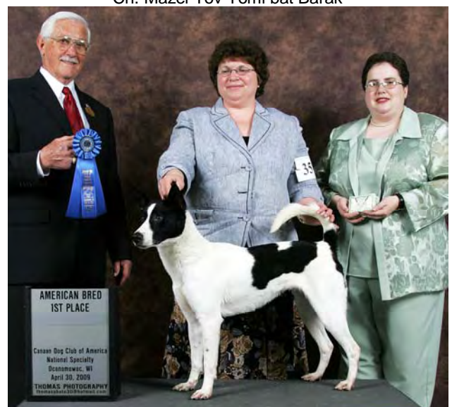
Am Bred Bitch D&J Ha'Aretz AJB's Matityah