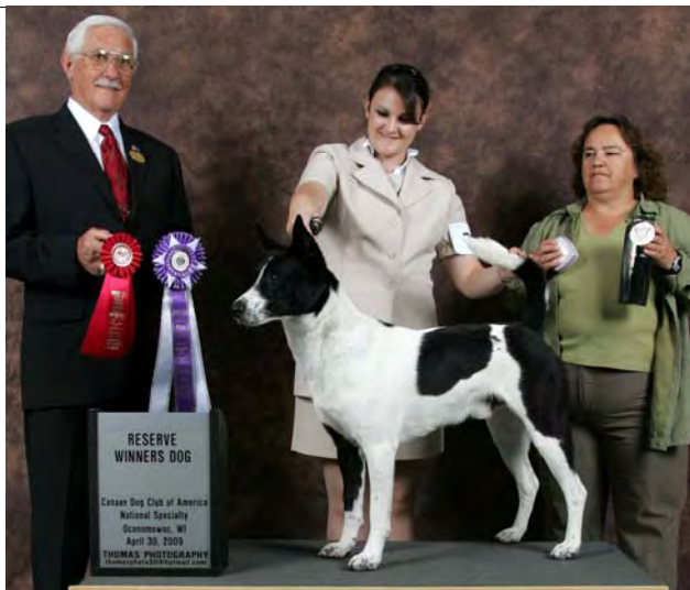
Reserve Winners Dog Tahoe's Sirius Black N White