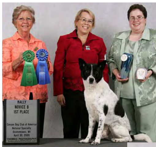
Rally Novice B, 1st Place Ch. Pleasant Hill What's the Buzz, OA, OAJ, OAP, OJP