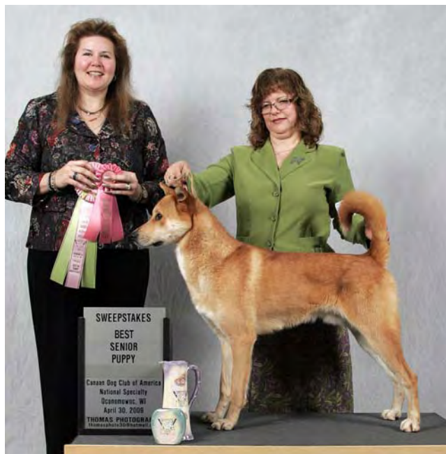
Puppy Sweepstakes Best Sr. Puppy Cherrysh Keep the Fire Burning