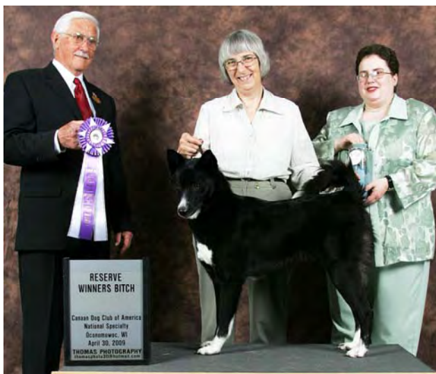
Reserve Winners Bitch Blue Sky Desert Star Luna Eclipse