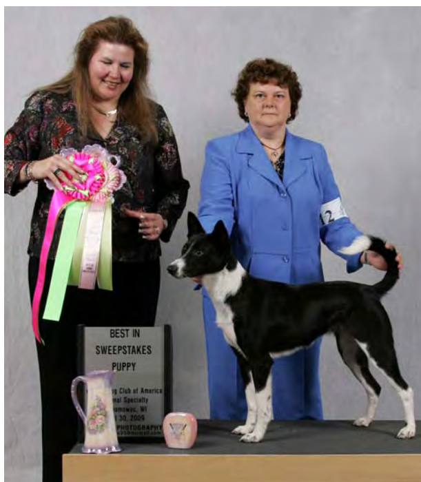
Best in Puppy Sweepstakes Eastland's Bit of a Braveheart