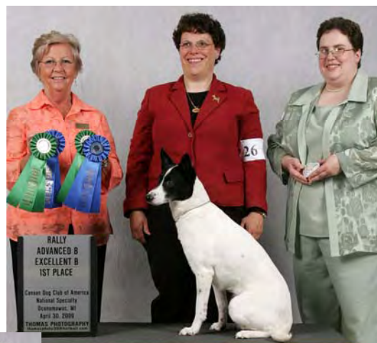
Rally Advanced & Excellent B, 1st Place Ch. Mad River Samara Desert Star Dawn, RE