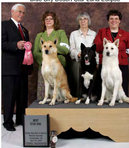
Stud Dog Ch. Cherrysh Sing Hosanna