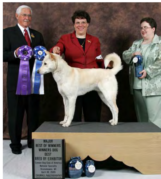
Best of Winners BlueSky DesertStar Orion the Hunter