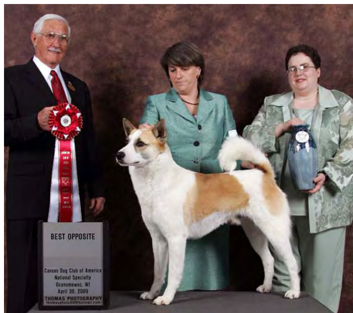
Best of Opposite Sex Ch. Pleasant Hill Wish Granted