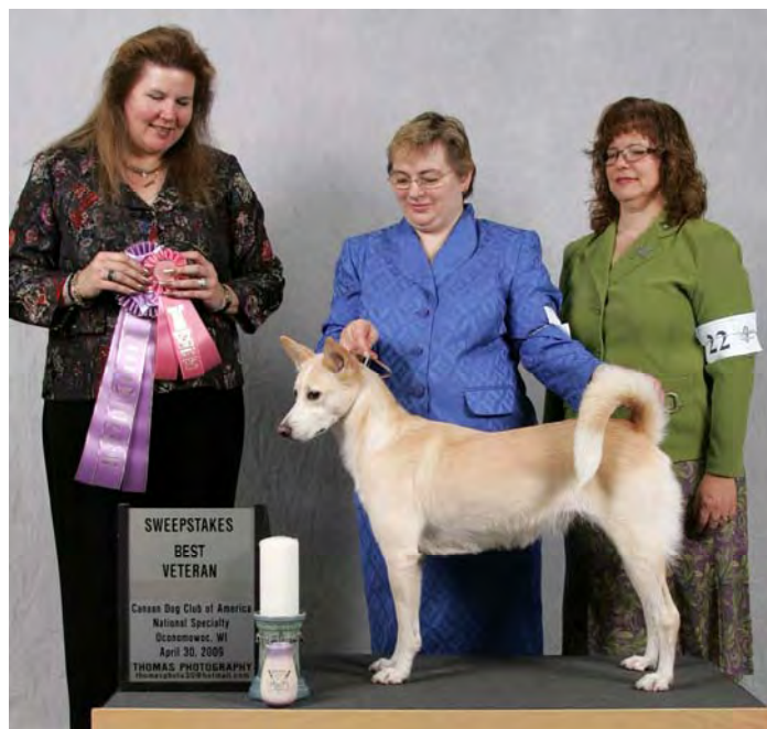
Best of Opposite Sex in Veteran Sweep- stakes Ch. Cherrysh Mi Corazon Miracle