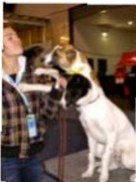
edulustan mythical canines