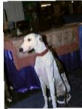
feed me pleez feed me