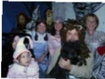
dorothy o' the wizard o' oz and a dark cairn terrier