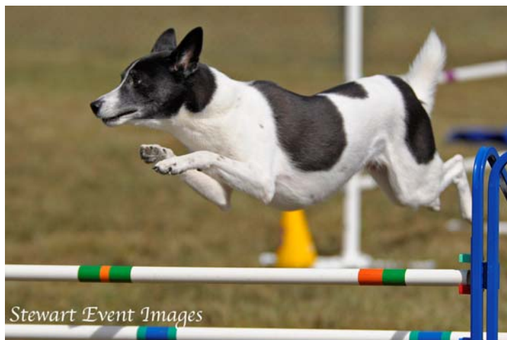
MACH2 Mazel Tov PRTMJL Minnie Pooh, CD, XF, MAD, JM, GM, RM, ATD-BRONZE

CH Pleasant Hill Mazel, CDCA-HCX x Pleasant Hill Tovah