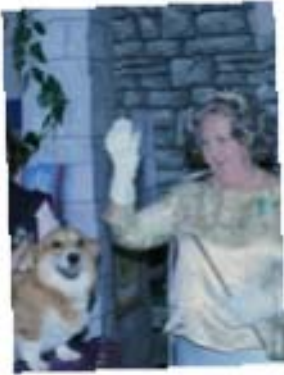
the queen and her corgi