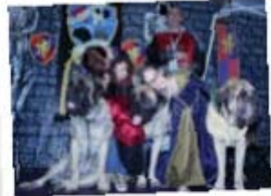
english mastiff and their mahsters