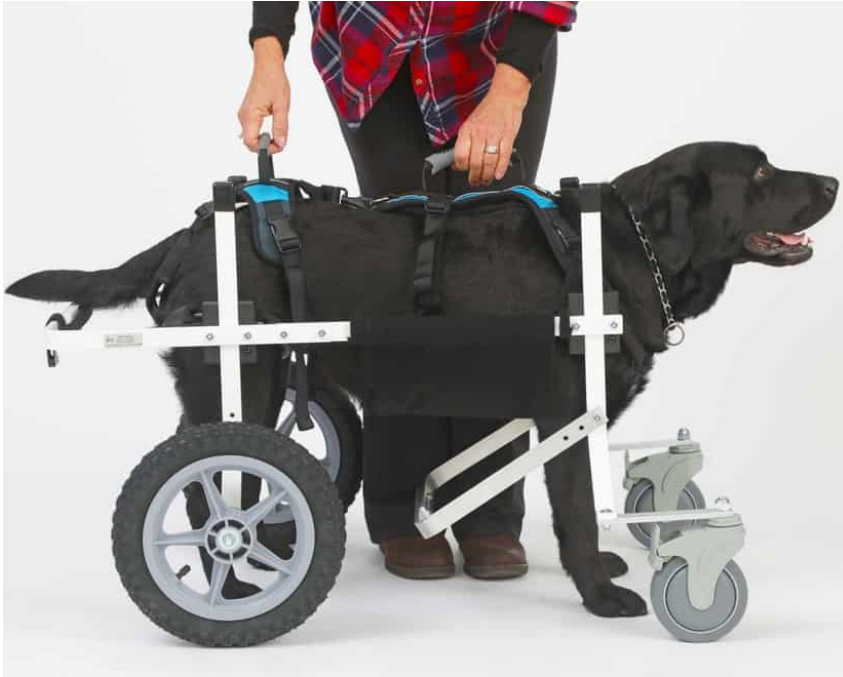
Help ‘Em Up Harness With Dog in Wheelchair image from the K9 Carts website

breeds in how DM presents and progresses, and among individual dogs as well. Symptoms sometimes plateau for significant periods, or never progress past a certain point. Hava and I just go day to day, and I treasure the time that we have together.