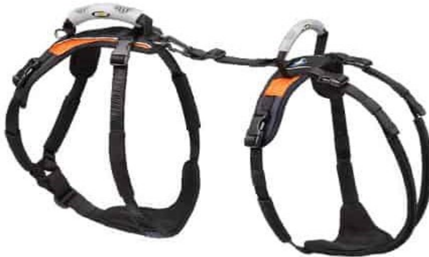
Help ‘Em Up Harness image from the K9 Carts website

Concerning time left, there are differences between