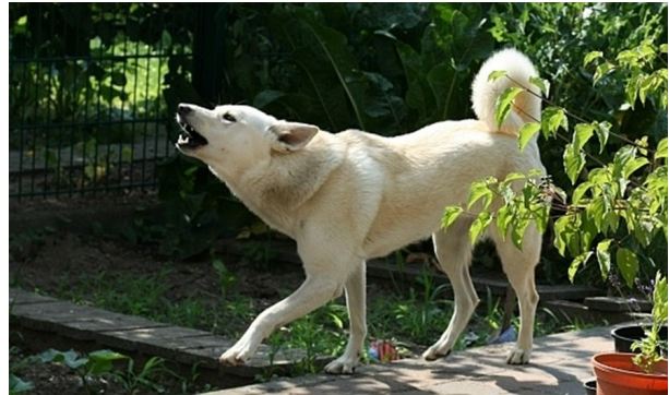
Berish de Solemel at Canaanoasis 2016, Stutensee, Germany

In our view, breeding impairs, reduces or even prevents natural selection, thereby favoring the survival of weaker or sickly dogs; which then may, undesirably, pass on genetic conditions, or predispositions, to future generations, which would not be conducive to establishing a standard of good health within the breed. Of course, this could also be true for dogs that are born in the wild and added to the stud book without preliminary tests for genetic conditions; having been born in the wild does not guarantee better health. Hence it is recommended to test for breed specific conditions through health checks and DNA testing beforehand, as a preventive measure.