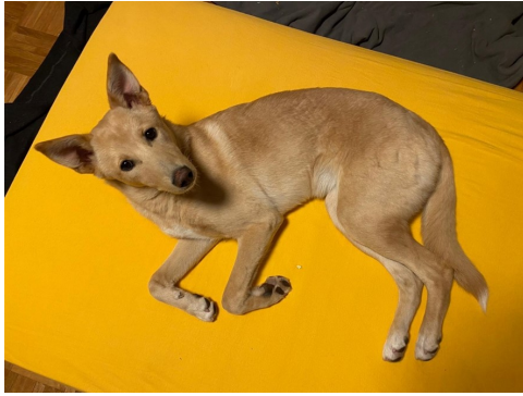
"Apricot" Aivi me Canaangen