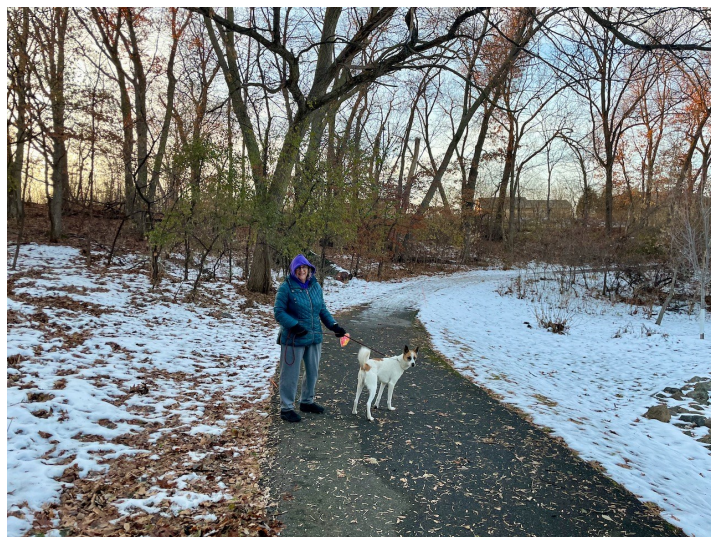
November walks sometimes required more fortitude.

In September, I read that titles would officially launch in January 2023, but AKC invited people to start participating and recording their activities with their dogs anytime, and then to submit their documentation in January.