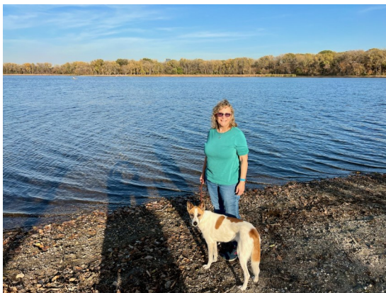
It was a pleasure to walk FIT DOG miles with Simi in October!

In Fall 2022, the American Kennel Club (AKC) announced an opportunity for humans and their dogs to increase their fitness and earn titles. Anyone who can walk their dog can work on these titles, but you also can apply other activities you do with your dog, such