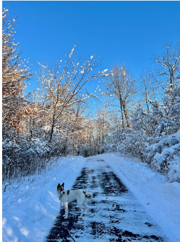
December provided its own beauty.