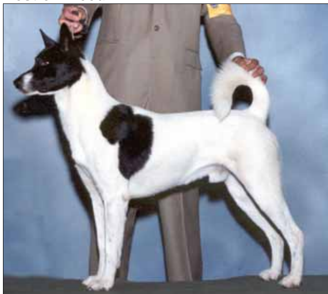
Ch. Jealou's Got Milk O'MadRiver