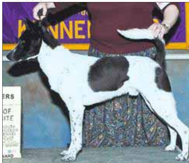
Ch. Rosendog's He Who Must Be Named