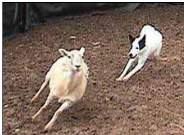
Yomi herding.