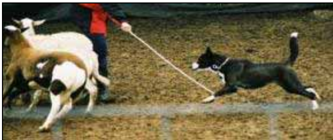
Tally earns her HC.