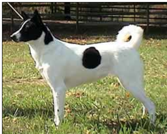
Ch. RivRoc Three Sunrises Lyceum