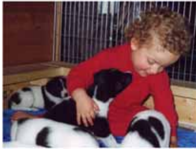
Puppies socialized and raised with children.

Breeding for health, temperament, conformation and trainability