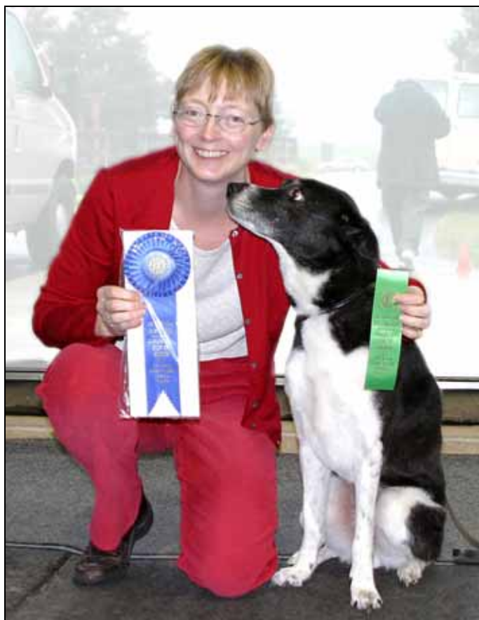
Me & my High In Trial dog, Tycho, at the 2004 specialty.