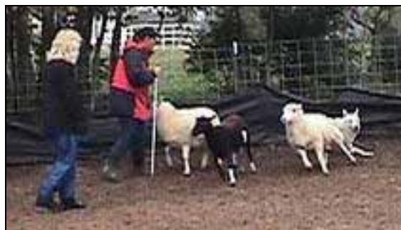
Blaze shows the sheep his stiff upper lip while earning his HC.