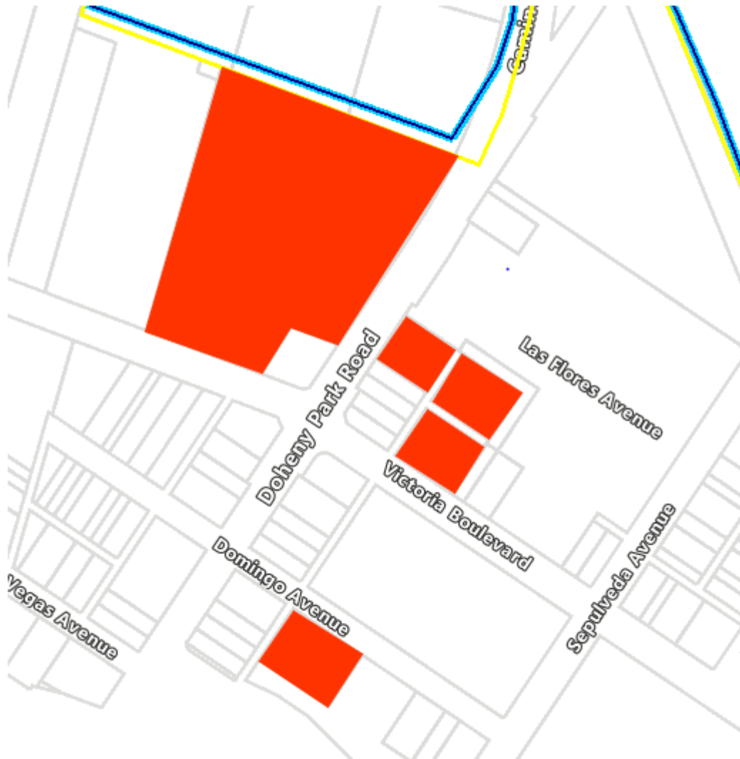
EXHIBIT A HOUSING INCENTIVE OVERLAY

split-zoned as Community Facilities District and Recreation District, with no changes to allowable uses and development standards as specified in Chapter 9.19 and Chapter 9.21.