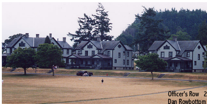
Fort Worden Officer Quarters