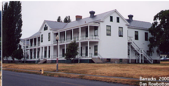
Fort Worden Barracks