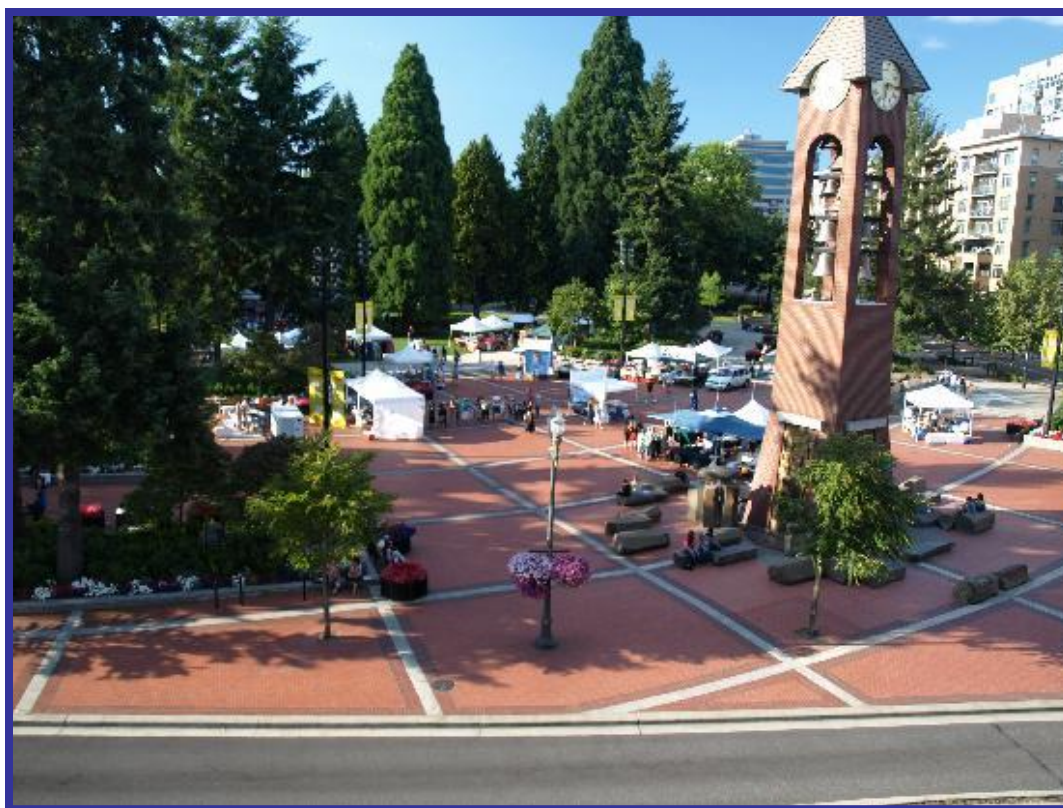
Bell tower across from the Vancouver (WA) Hilton.