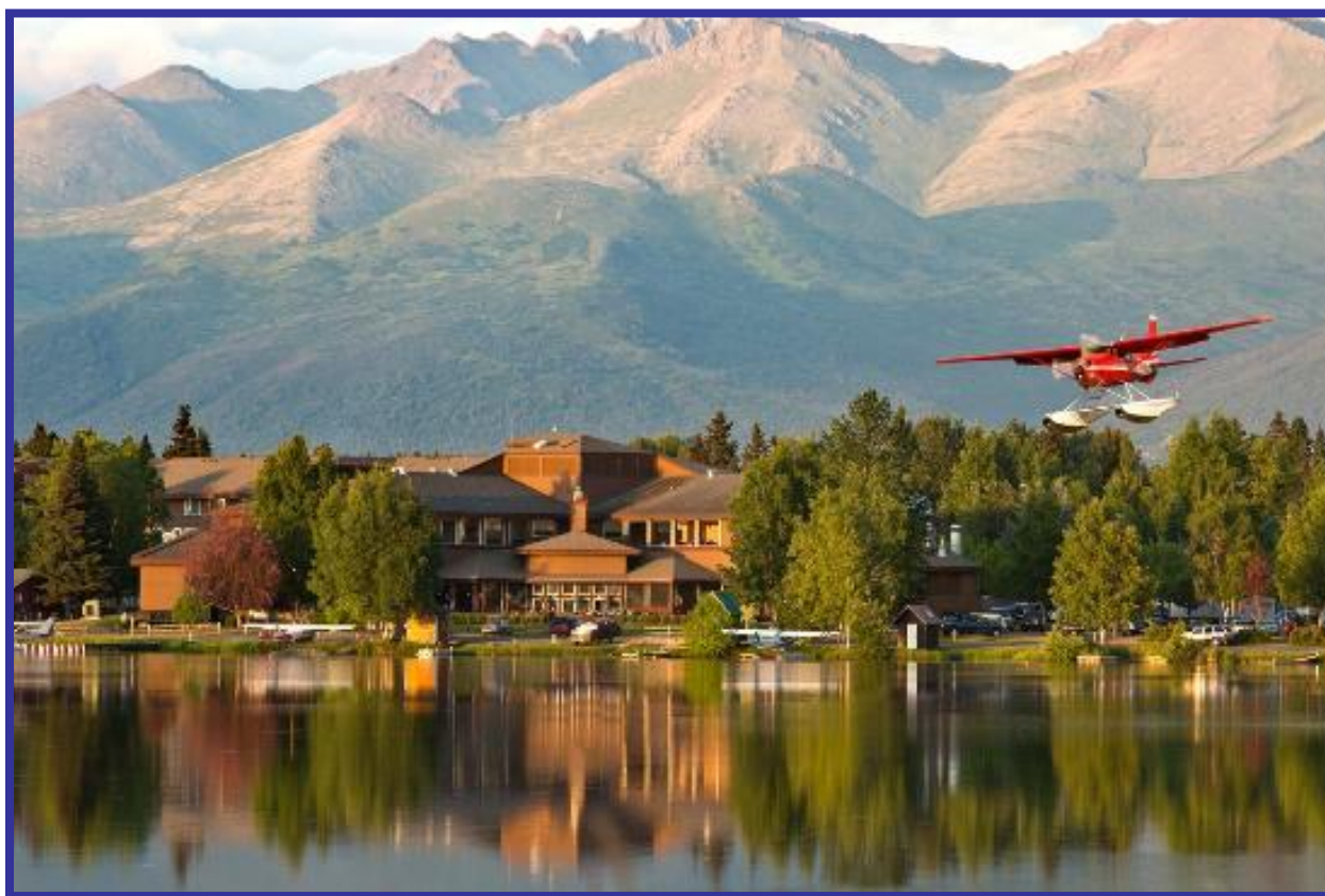
The Lakefront Anchorage Hotel