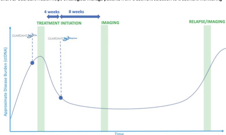
Chart 2: Guardant Health helps oncologists manage patients from treatment selection to treatment monitoring 1-10

With both commercially available tests, Guardant Health now offers an end-to-end solution that empowers oncologists with insights to help them make first- and second-line treatment decisions with the FDA-approved Guardant360 CDx test, and then monitor treatment response with the Guardant360 Response test.