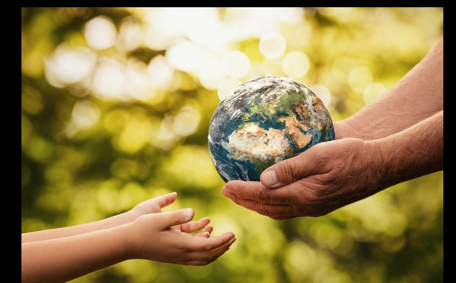
(Colorado, Taylor 5)

Reduction in Colorado's GHG Emissions Overall