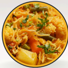
MIX VEG TAHARI