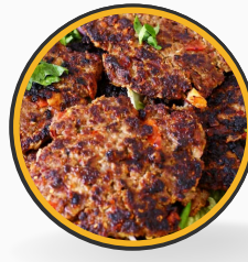
CHICKEN CHAPLI KABABS (3)