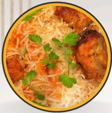
CHICKEN TIKKA BIRYANI