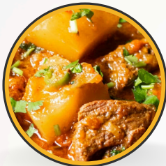
ALOO GOSHT (BEEF)