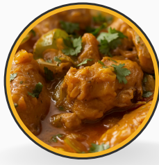
CHICKEN SHIMLA MIRCH