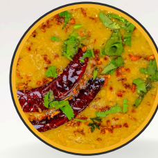
CHANA DAL TADKA