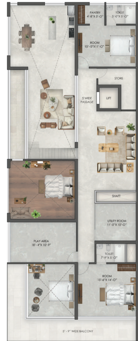
Attic Floor Plan