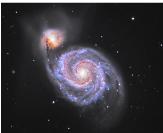
Whirlpool Nebula M51