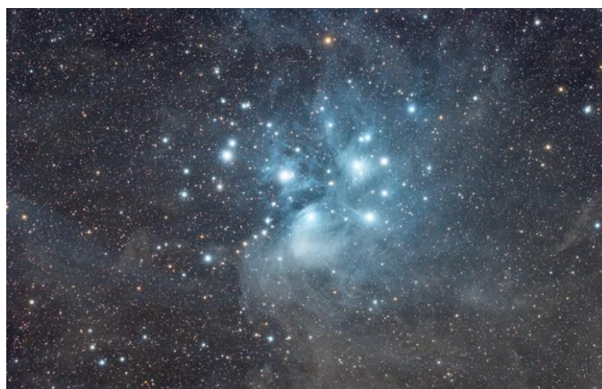
The Seven Sisters (Pleiades)