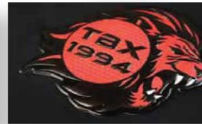
3D HF TPU | Gloss