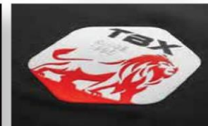
3D Woven | High Definition

Note: Min of 400 pieces and must allow 4-5 weeks to make custom 3D PU logos.