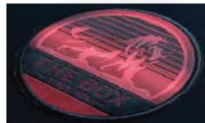
3D Woven | Hd X Embroidery