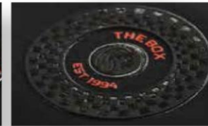
3D Silicone | Micro