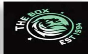
3D Silicone | Glow In Dark