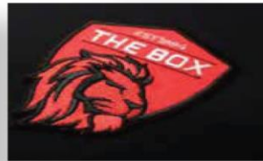
3D Embroidery X Twill