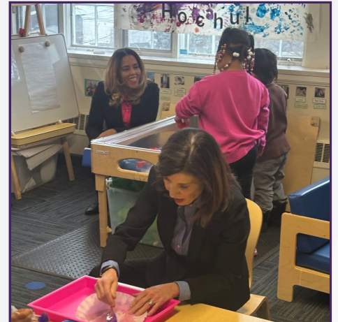
Gov. Hochul, front, and Commissioner Harris-Madden, rear, at Dutchess County child care center.

Under the plan, the state will provide each of the three participating counties with $22 million for their pilot programs, with the counties contributing an additional 10% in funding. The programs will support up to 1,000 seats for children from birth through age 3 in each county, with the first seats opening in 2027.